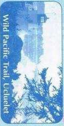
Wild Pacific Trail, Ucluelet

Welcome to the Wild Pacific Trail: For your safety, it is strongly recommended that you stay on the trail. Failure to do so or walking on the rocks below may result in serious injury or death. The trail is restricted to daylight hours only. As this is a wilderness park area, please use caution to protect the environment, yourself and other trail users. The trail may be unsafe during storm surf or high winds may cause tree blow downs. Visitors use trail at their own risk. CAUTION: You may encounter bears, cougars or wolves anywhere on the West Coast. If you encounter a wild animal while hiking, stay calm and talk to the animal in a confident voice. PETS: Keep dogs on a leash at all times.