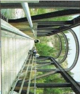
KVR Bridge & 1000+ foot Tunnel Princeton