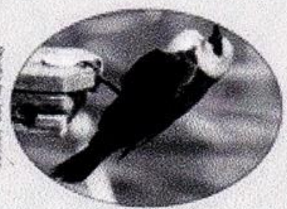
Yellow Headed Blackbird